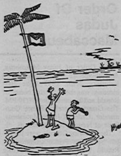
"I'm a little rusty on my Morse code but I think he's asking 'What lodge?'"